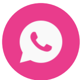
WhatsApp & Turn

While our initial focus has been on expanding the reach of our WhatsApp channel, TeacherConnect has also grown to include multiple touch points to cater for our Educators, where they are , and on the channel they are most comfortable with.